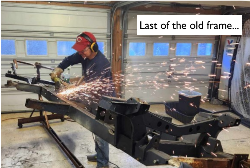
Last of the old frame...

Moving right along—finished with the old frame and progress on the rebuilt car looking good.