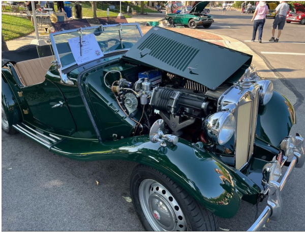
McLaren won best British Sport