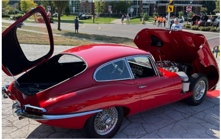
Jag E type coupe—won Premier