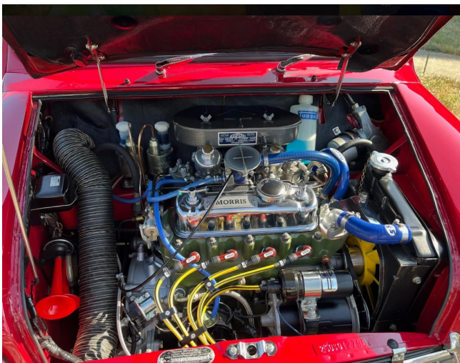
Really nice mini engine