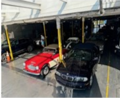
On the Ferry