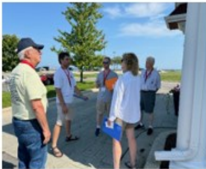
The OVAHC Teching