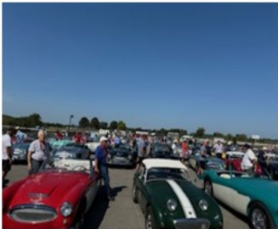
Queuing up for the big picture at RA