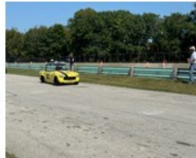
Jeff at Road America