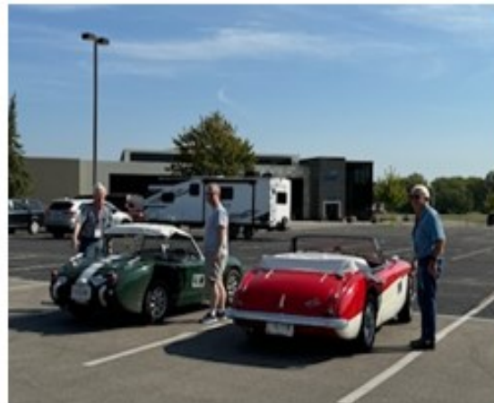
EAA Museum @Aviation Mecca (Oshkosh WI)