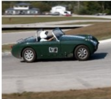
Old Man in Luki