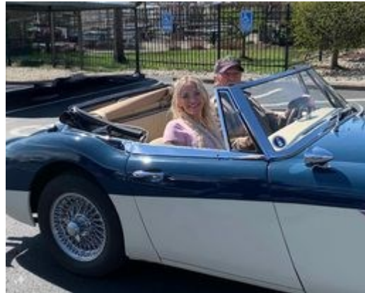
Can't trust those old men when they are out to lunch alone. Really, caught in the act!